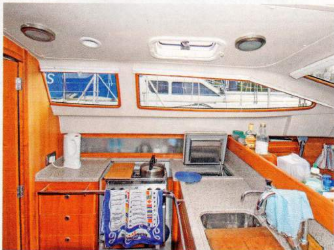
The galley is well laid out and big enough to cook for a crew of 10!