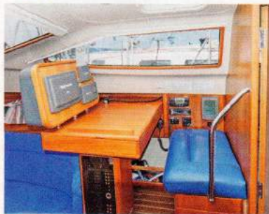
Having the chart table and seat raised up allows excellent forward vision