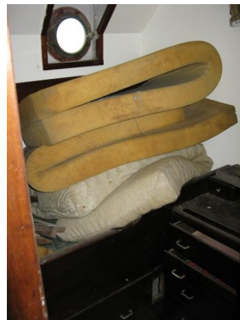
Port guest cabin