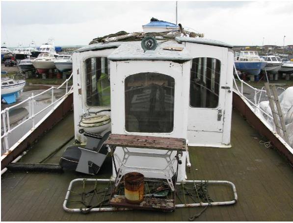
Rear view of wheelhouse