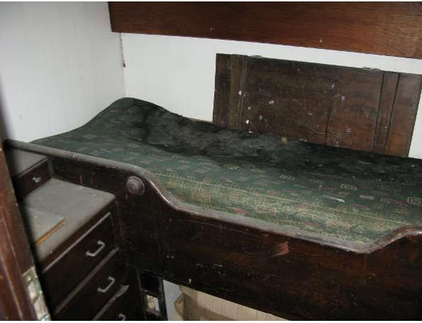
Starboard guest cabin