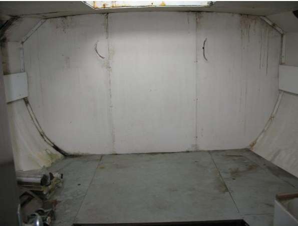
Aft master stateroom