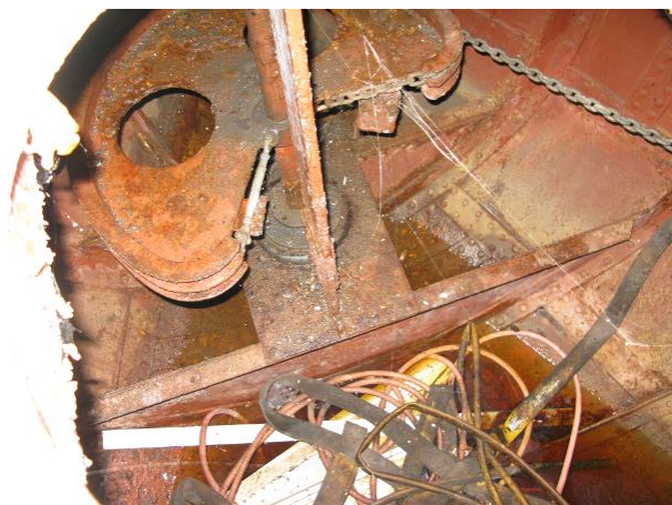
Aft peak / steering compartment