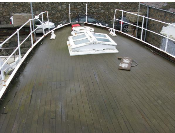
Aft deck and stateroom roof light / ventilation hatch