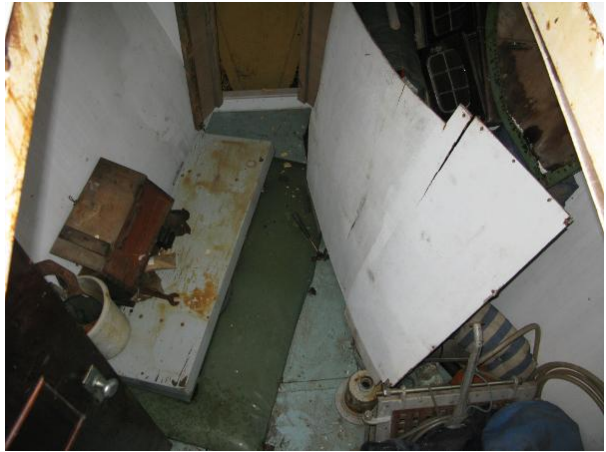
Forward crew cabin / store