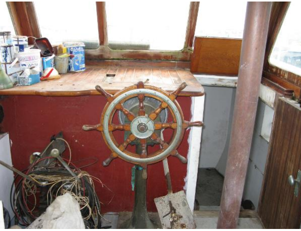
Wheelhouse / deck saloon