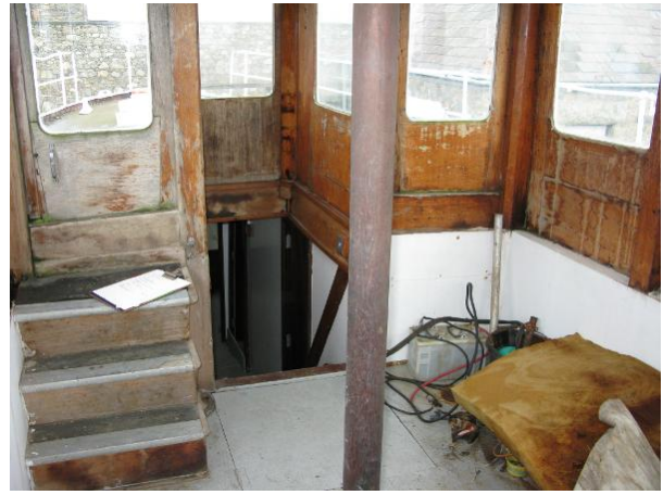
Aft wheelhouse access and companioway