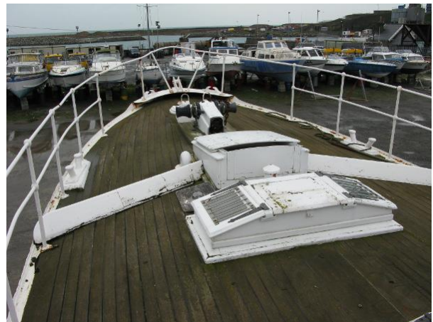
Foredeck, crew cabin access and galley roof light / ventilation hatch