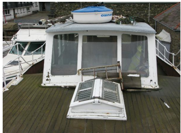
Front view of wheelhouse and saloon deck light / ventilation hatch