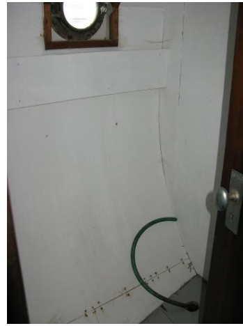
Day / guest heads compartment