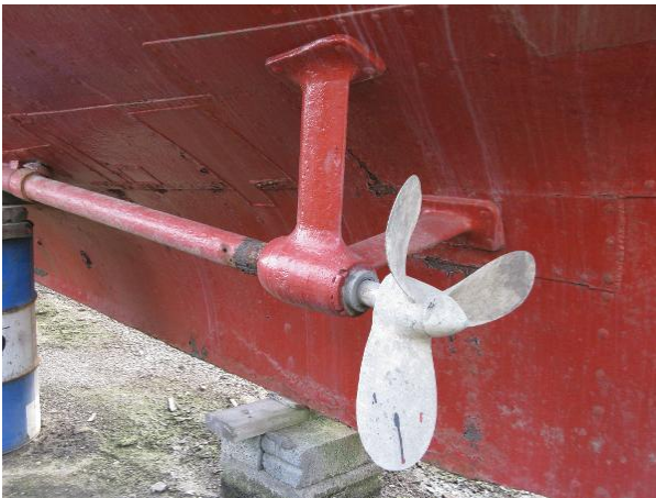
Port propeller, A bracket and shaft