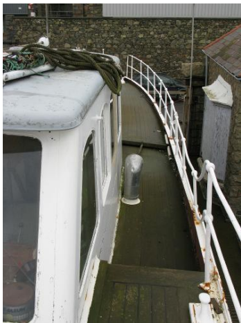
Port side deck