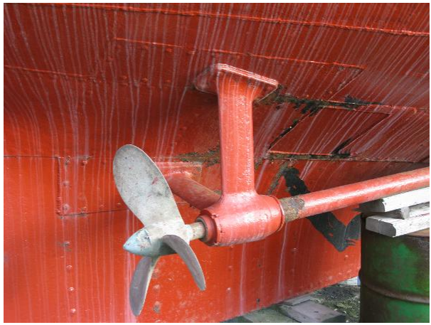
Starboard propeller, A bracket and shaft