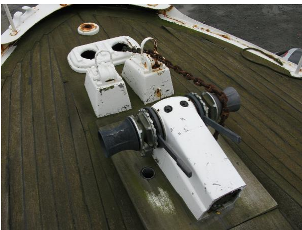
Anchor windlass / capstan