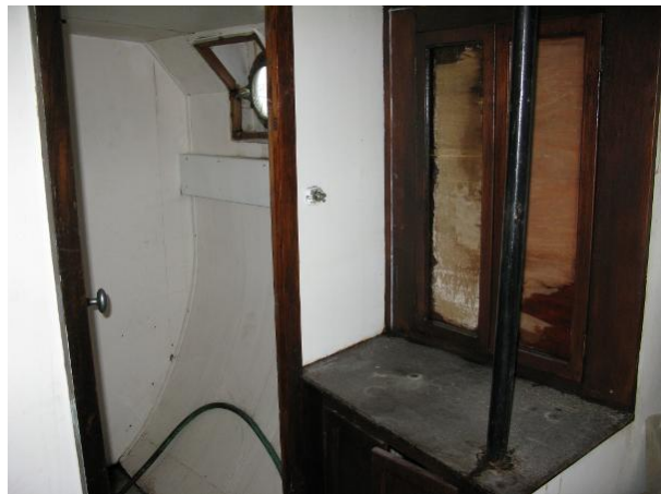
Stateroom vanity unit and en suite heads compartment