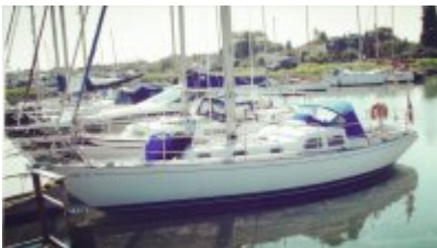
S & S 34 - Kite.jpg