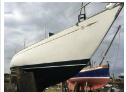
S & S 34 - Kite 2.jpg