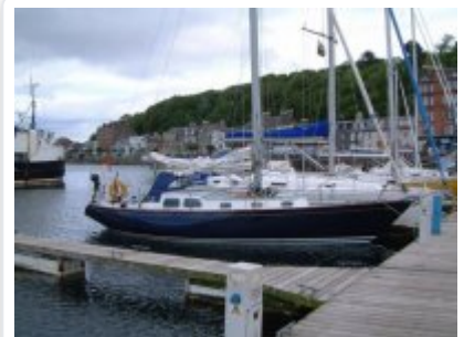
S & S 34 - Earlybird (on YBW Forum).j...