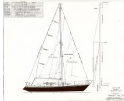
S&S 34 sail plan.jpg